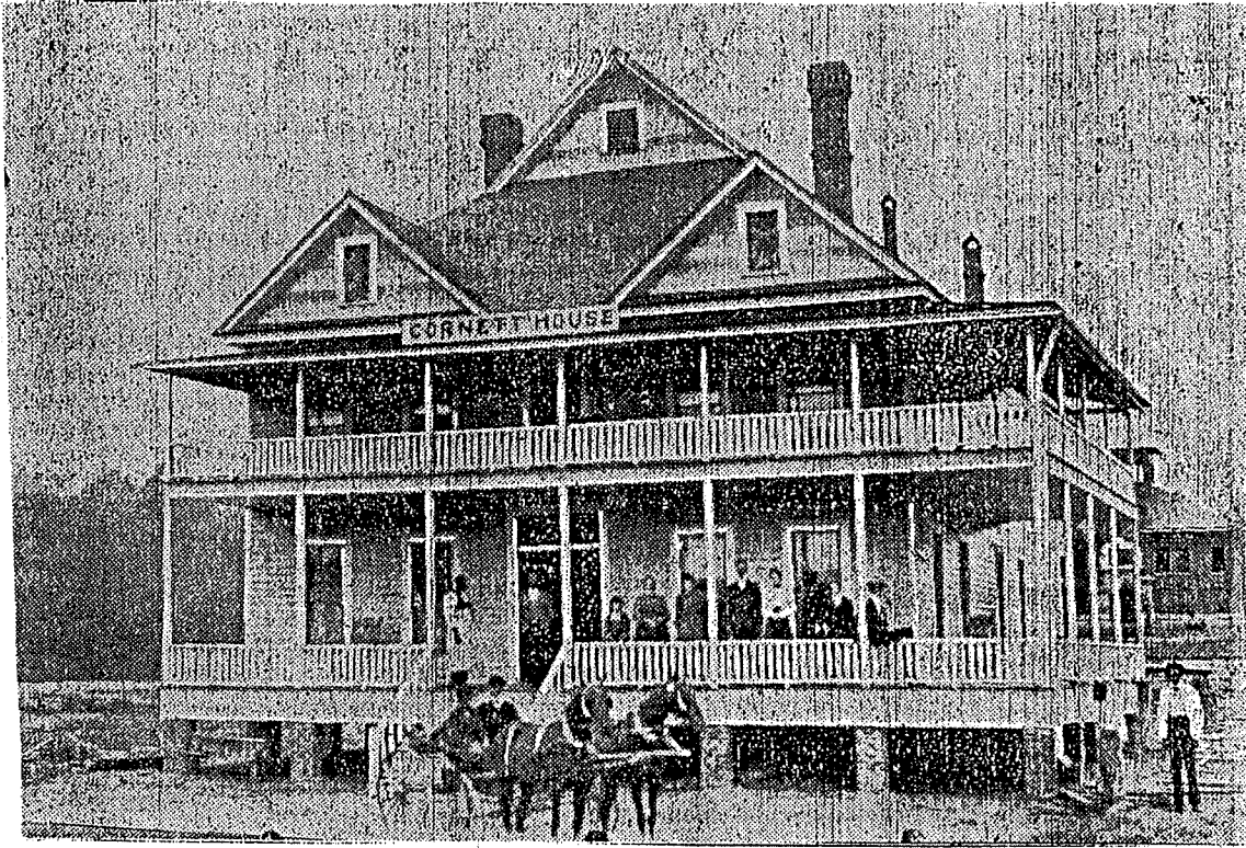
Cornett Hotel - circa 1902