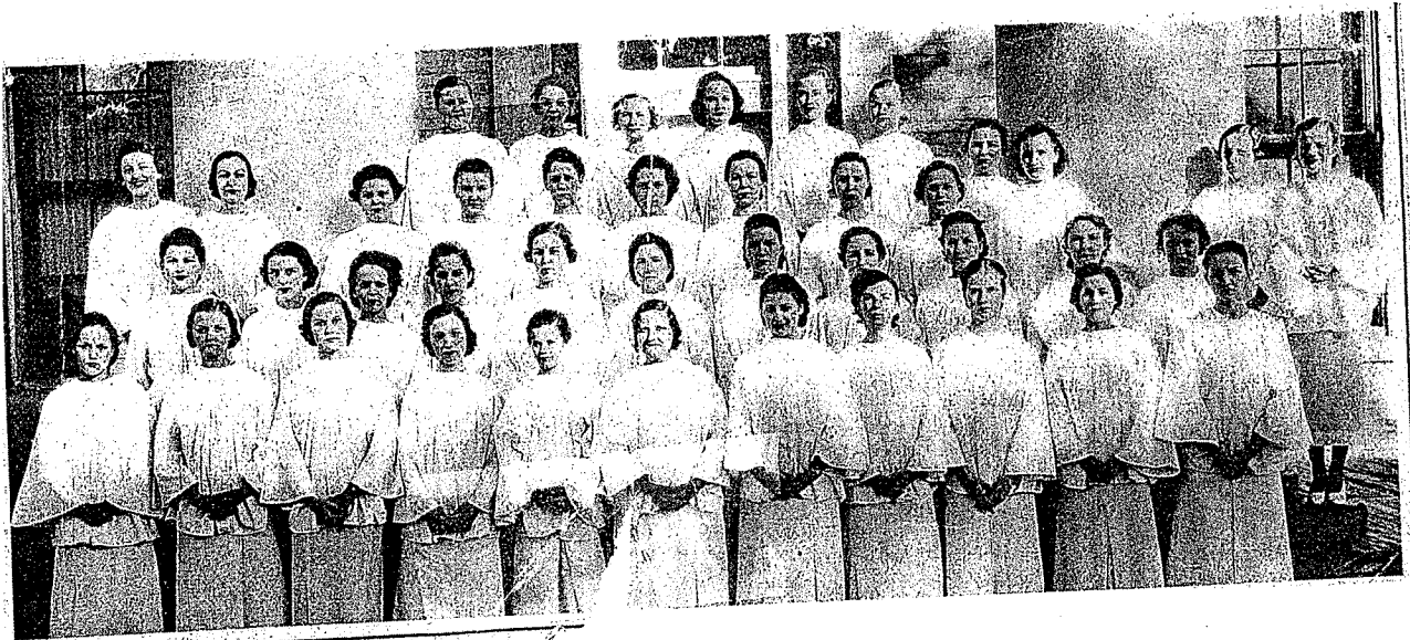
Above: ATHENS COLLEGE GLEE CLUB, attired in new robes for the concert season, has embarked on an ambitious program for the year. Many of the college members are shown here.