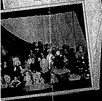
Below: "KING COTTON ON PARADE" was a series of tableaux given at Pell City, where 75 pupils appeared in costumes made exclusively of cotton manufactured by Avondale Mills in that community.