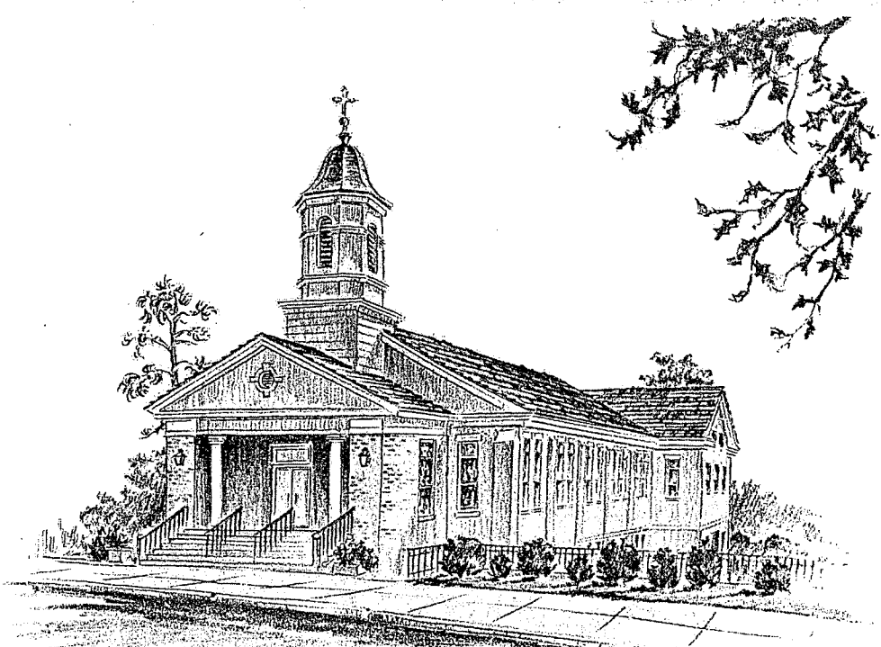
The First United Methodist Church Pell City, Alabama